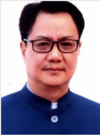
Shri Kiren Rijiju Hon'ble Minister of State (Independent Charge) Ministry of Youth Affairs and Sports & Minority Affairs Government of India

A member of the Bharatiya Janata Party, Rijiju is the current Minister of State (Independent Charge) of the Ministry of Youth Affairs and Sports and Minister of State in the Ministry of Minority Affairs of India.