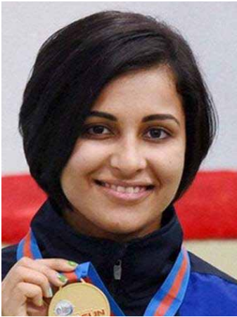
Heena Sidhu Indian Shooter

Heena Sidhu is an Indian sport shooter. On 7 April 2014, Sidhu became the first Indian pistol shooter to reach number one in world rankings by the International Shooting Sport Federation. In 2013, Sidhu became the first Indian pistol shooter to win a gold medal in an ISSF World Cup finals when she won the 10 metre air pistol event. In 2014, Sidhu was the World record holder in the 10 metre air pistol event. Sidhu is right handed and is right eye dominant.