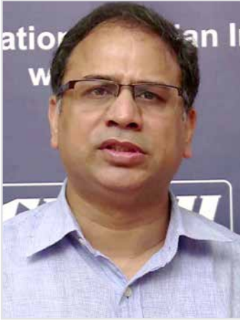
Vishal Kumar Dev Commissioner-cum-Secretary for Sports and Tourism Government of Odisha

Shri Dev is Commissioner-cum-Secretary for Sports and Tourism to Government of Odisha.