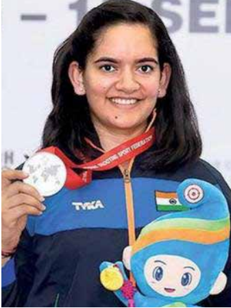
Anjum Moudgil Shooter

Anjum took up shooting while studying in Sacred Heart Senior Secondary School in Chandigarh. She completed her graduation and post graduation in humanities from DAV College, Chandigarh. She completed her Masters in sports psychology. She is an avid abstract artist and has sold many of her artworks. She became a Sub Inspector (SI) with Punjab Police, India.