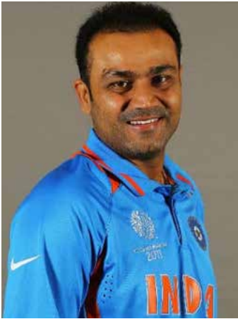
Virender Sehwag Former Indian Cricketer

Virender Sehwag (born 20 October 1978) is a former Indian cricketer. Widely regarded as one of the most destructive batsmen of all time, Sehwag played as an aggressive right-handed opening batsman and also bowled part-time right-arm off-spin. He played his first One Day International in 1999 and joined the Indian test side in 2001. In April 2009, Sehwag became the first Indian to be honoured as the Wisden Leading Cricketer in the World for his performance in 2008, subsequently becoming the first player of any nationality to retain the award for 2009. He is the former Occasional captain of India, former Vice-Captain of India, former captain of Delhi Daredevils and former captain of Delhi Ranji Team.